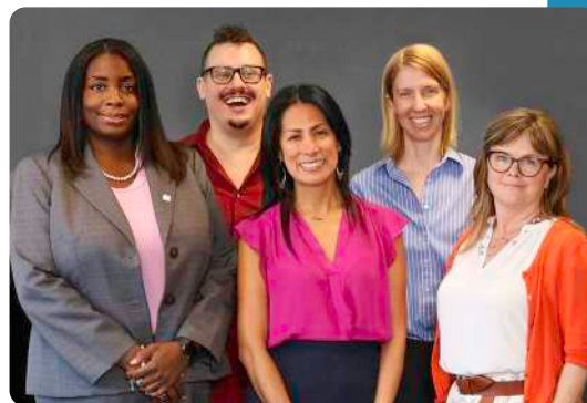
2024 Leadership Evanston Participants

ULI officially launched at the foundation's Community Impact Celebration held on November 7, 2024. In addition to uplifting the work and impact of our talented community partners and grantees, we were proud to introduce exciting new programming such as: Board Leadership Training , Leadership Circles affinity groups, and Legacy Leaders Network —an exclusive online digital platform for LE alum.