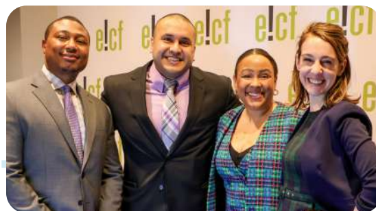
2024 Leadership Evanston Public Service Honorees

ECF officially launches ULI initiative while the 32nd class of LE graduates and is welcomed into our 850+ strong LE alumni network.