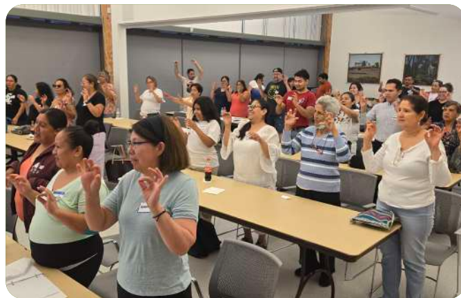
Padres Empoderados at a Mental Health Workshop

As a foundation, we quickly recognized this as an opportunity to deepen our commitment to community and examine our relationship to equity — in this particular case, language equity. This led us to a groundbreaking decision to proudly launch our first-ever fully bilingual Community-Led grant cycle. Not only were our 2024 Community-Led Grantmaking applications available in Spanish but, the entire grant cycle, from promotion to review.